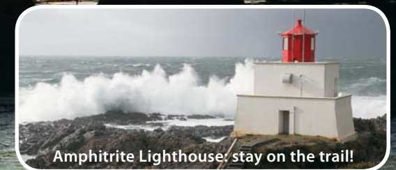
Amphitrite Lighthouse, stay on the trail!

T he Wild Pacific Trail traces 8 kms of the rugged west coast of Vancouver Island. Enjoy matchless panoramic views of Barkley Sound and the Broken Group Islands. This famous trail meanders beneath the forest canopy and along a spectacular coastline abundant with birds and marine wildlife. A memorable walk for hikers of all abilities.